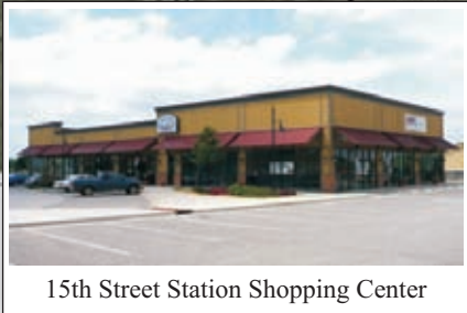
15th Street Station Shopping Center