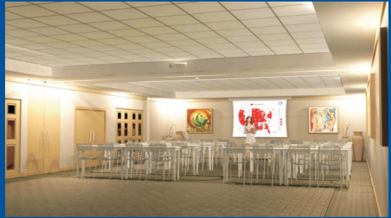
Gerald Marshall Conference Center