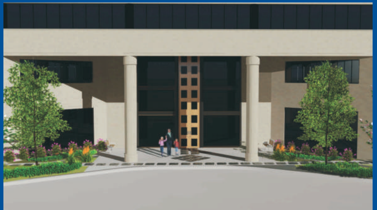
Main Entry Plaza