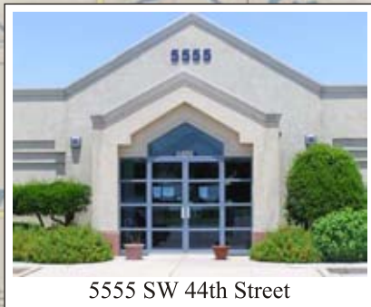
5555 SW 44th Street